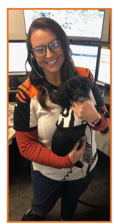
"Who Ya Gonna Call?"